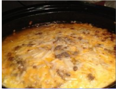
Picture of my crock pot breakfast scramble used for our meeting in the park breakfast burritos. Recipe will be in the December newsletter.

I made a potato, egg, cheese and sausage crock pot dish. I then took Costco's fresh tortillas and cooked them over the cook stove. With salsa or Saricha sauce, breakfast burritos were had by all. I had multiple people tell me that they were awesome!